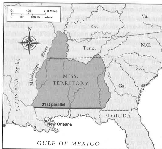
PINCKNEY'S TREATY, 1795

In addition to coping with foreign challenges, stabilizing the nation's credit, and organizing the new government, Washington faced a number of domestic problems and crises.